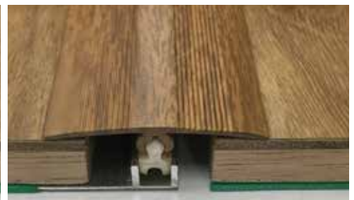
Expansion / Transition