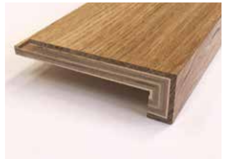
Click Stair Nosing