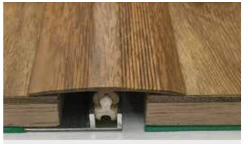
Expansion / Transition